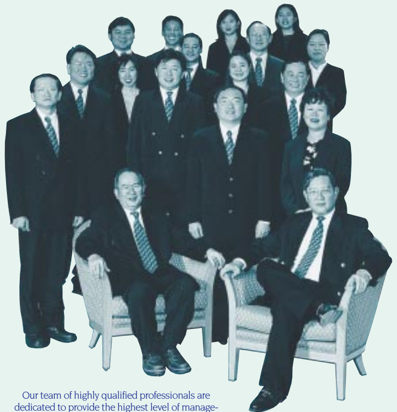
Our team of highly qualified professionals are dedicated to provide the highest level of management and real estate consultancy services.

On this joyous occasion, I would like to thank all our clients and business associates for their support and co-operation. And to all our staff, this creditable achievement would not have been possible without their effort and dedication.